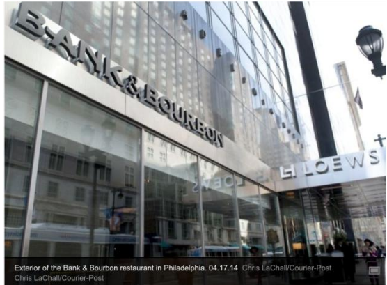
Exterior of the Bank & Bourbon restaurant in Philadelphia. 04.17.14