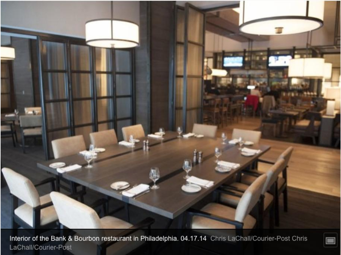
Interior of the Bank & Bourbon restaurant in Philadelphia. 04.17.14