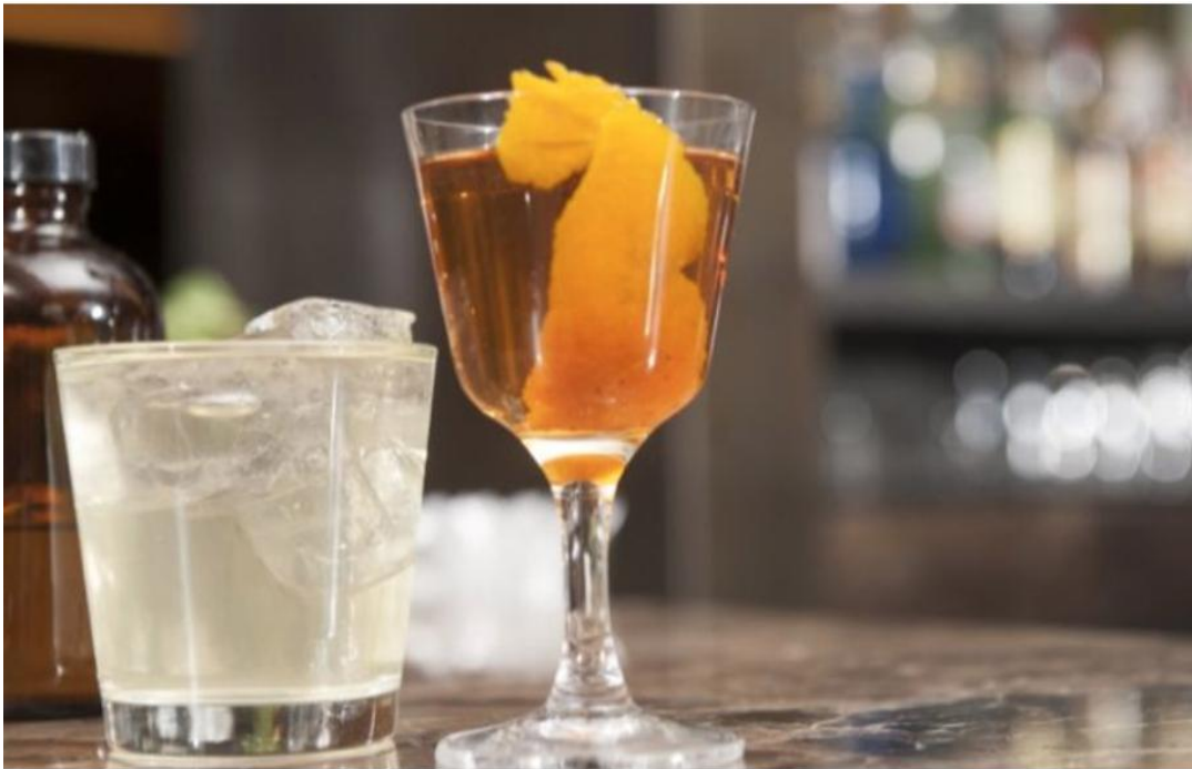
A Secret Knock cocktail (aged whiskey, green tea, lemon, and clarif), left, and a Northeast Regional cocktail (buffalo trace, root, and absinthe), right, at Bank & Bourbon restaurant in Philadelphia. 04.17.14